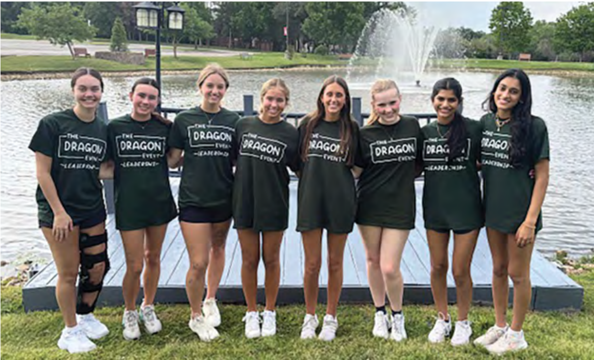
Saturday, April 26 was a campus workday at White’s Chapel, with numerous volunteers from Carroll High School pitching in for an assortment of tasks around the property.

And what I want to say to our graduates, I want to say to all of us: You’re about to merge onto new highways—college, careers, new communities. Some days you’ll feel unstoppable. Other days you’ll be tempted to pull over and call it quits. But don’t settle for easy. Don’t mistake rest for retreat. God’s best dreams are almost always just past the place you feel like stopping. And church family, the same goes for us. Faith has no retirement plan. Growth has no expiration date. We are all still called forward—onward—deeper into grace, closer to Christ, bolder in love. Keep driving. And keep trusting... for the best is yet to come!